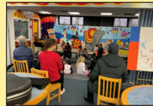
In the Children's Room