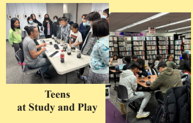
Teens at Study and Play

Let us know how we're doing...please take a few minutes to take our survey.