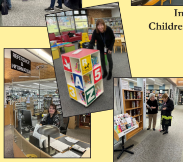
Our Helpful & Friendly Staff